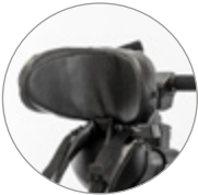
3-Way Adjustable Headrest