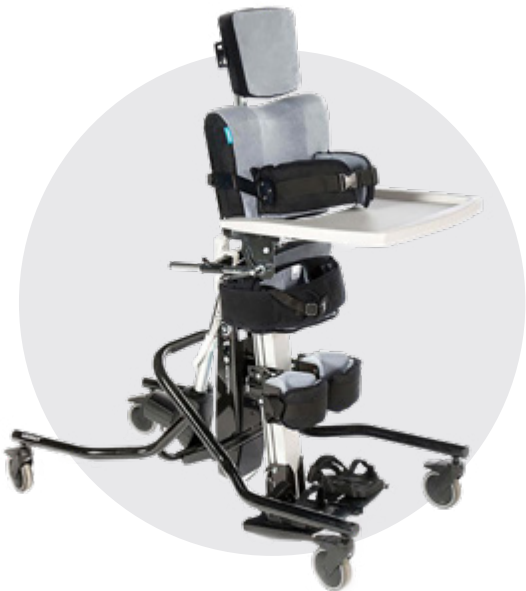
Available in grey