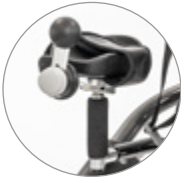
3-Way Adjustable User Handles