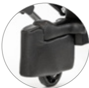
Narrow Saddle & Drop Attachment